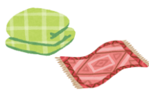
Bedding, carpets, Mattresses (without springs) Up to 5 per day