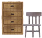
Furniture, wood products, sofas, etc. Up to 5 per day

<Examples of items bulky items that may be disposed and their quantity restrictions >