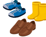
Athletic shoes, leather shoes, boots

《Garbage bags designated by Yatsushiro City》