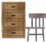
Furniture, wooden products, etc. Up to 5 per day

<Examples of items bulky items that may be disposed and their quantity restrictions >