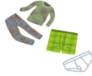
Dirty clothes, underwear